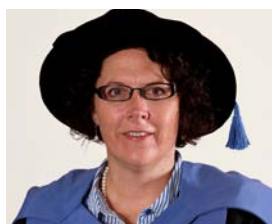
Dean of Science

BEng (Hons) SBankPoly PhD SBank, AgriTech NZ