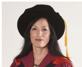
Assistant Vice-Chancellor Pacific