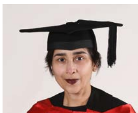
Dean of Law

BA Waikato, PGDipMPD Waikato, MMPD Waikato, CertCrim Wellington