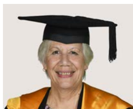
Acting Dean of Māori and Indigenous Studies