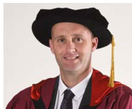
Head, School of Management and Marketing

BAGSc(Hons) Lincoln College, PhD Hawaii, BD Melbourne