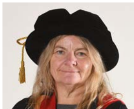
Pro Vice-Chancellor Teaching and Learning

AA (Social Sciences) Citrus College, LLB (First Class Hons) Waikato PhD Waikato