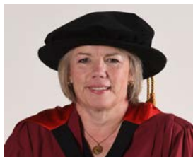
Head, School of Education