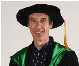
Head, School of Arts

PhD (Canterbury), BA Hons (Canterbury), BCom, DipTching