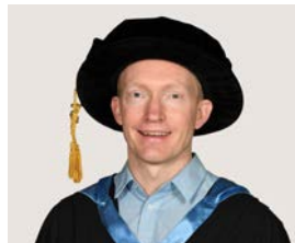
Acting Head, School of Psychology

PhD (University of Wales, Cardiff); Diploma in Social Science Research Methods; BSc (Hons) Behavioural Sciences (First Class)