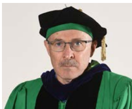
Head, School of Accounting, Finance and Economics