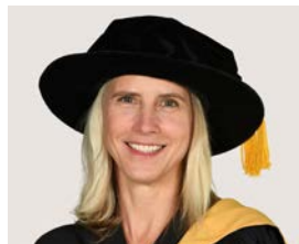
Dean of Graduate Research

BA (Hons) Sussex MPhil Cambridge PhD Auck