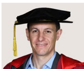
Acting Dean of Health

BSc MSc (Hons) Waikato, PhD Australian National University, GradCert (EdSt) University of Sydney