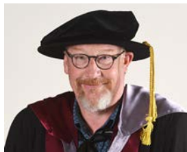
Head, School of Social Sciences