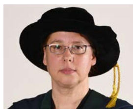
Head, School of Computing and Mathematical Sciences